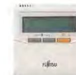
Wired Remote Controller