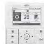
Wired Remote Controller (High grade)